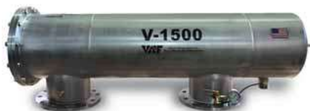
Horizontal Design for ease of installation