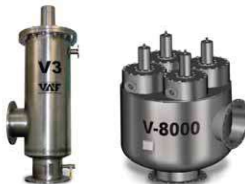
Vertical Design for minimal footprint